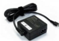
Additional dynabook Universal USB Type C™ PD AC Adaptor (PA5352E-1AC3)